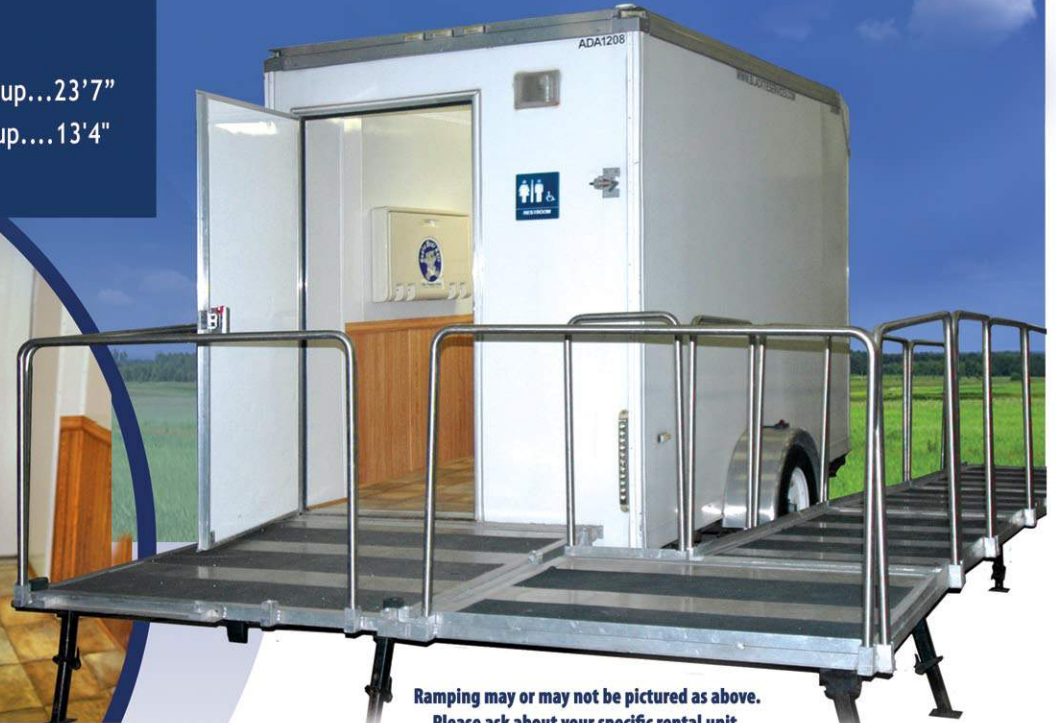
Ramping may or may not be pictured as above. Please ask about your specific rental unit.

This unit can be partnered up with one of our other larger restroom trailers to accommodate a high volume traffic count in either a public festival situation or public.